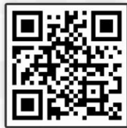
SCAN TO WATCH VIDEO

Homelessness in California’s Central Valley is most often caused by the lack of affordable housing, drug addiction, untreated mental illness and job loss. 1